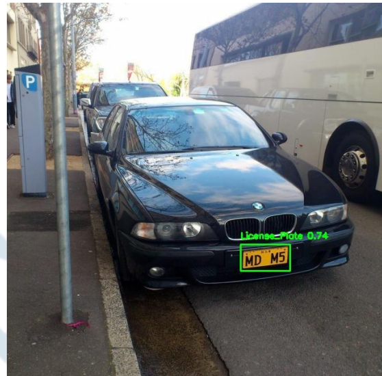
Fig. 1. Number plate detection